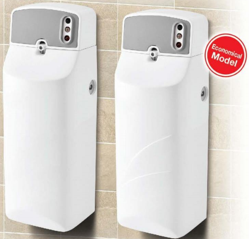
AZ 500 LED AZ 501 LED

Colour Available : White Can Size : Able to suit most of the market short can & tall can size Battery : 2 x D size battery (Super Heavy Duty & Above) Material : ABS Product Dimensions : 85(L) x 81(W) x 238(H)